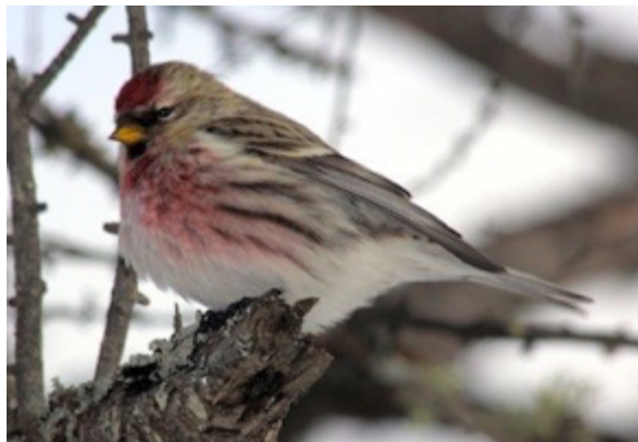
Common Redpoll, Adult male Small, stocky finch with red cap and rosy wash on breast and flanks - Cornell Lab of Ornithology

Affiliate of the Illinois Audubon Society, the Illinois Environmental Council, & the North American Bluebird Society